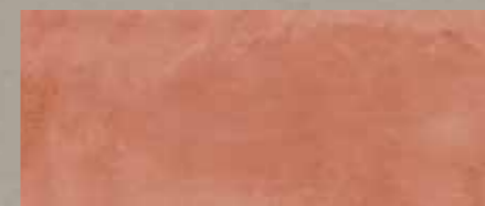
UNIMA UNIQUE MATTONE 74 MQ 20x50 8"x20" SPESSORE THICKNESS 8,5 mm MQ/BOX 1,20 KG/BOX 17,80 MQ/PALLET 76,80 BOX/PALLET 64 PCS/BOX 12