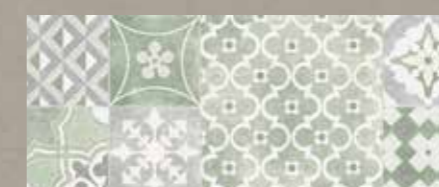
UNIMAVE UNIQUE MAIOLICA VERDE 92 MQ 20x50 8"x20" SPESSORE THICKNESS 8,5 mm MQ/BOX 1,20 KG/BOX 17,80 MQ/PALLET 57,60 BOX/PALLET 48 PCS/BOX 12