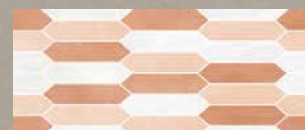
UNISTMA UNIQUE STRUTTURA MATTONE 92 MQ 20x50 8"x20" SPESSORE THICKNESS 8,5 mm MQ/BOX 1,20 KG/BOX 17,80 MQ/PALLET 57,60 BOX/PALLET 48 PCS/BOX 12