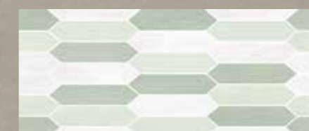
UNISTVE UNIQUE STRUTTURA VERDE 92 MQ 20x50 8"x20" SPESSORE THICKNESS 8,5 mm MQ/BOX 1,20 KG/BOX 17,80 MQ/PALLET 57,60 BOX/PALLET 48 PCS/BOX 12