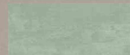
UNIVE UNIQUE VERDE 74 MQ 20x50 8"x20" SPESSORE THICKNESS 8,5 mm MQ/BOX 1,20 KG/BOX 17,80 MQ/PALLET 76,80 BOX/PALLET 64 PCS/BOX 12