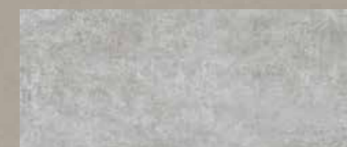
CONCPi CONCRETE PIOMBO 85 MQ 25x60 10"x24" SPESSORE THICKNESS 9 mm MQ/BOX 1,35 KG/BOX 19,20 MQ/PALLET 64,80 BOX/PALLET 48 PCS/BOX 9