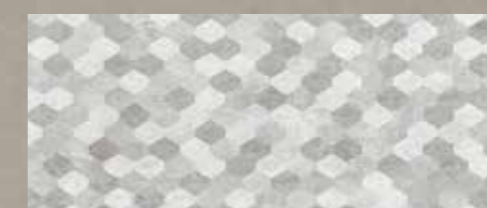
CONCMOGP CONCRETE MOSAICO MIX GRIGIO/PIOMBO 92 MQ 25x60 10"x24" SPESSORE THICKNESS 9 mm MQ/BOX 1,35 KG/BOX 19,00 MQ/PALLET 64,80 BOX/PALLET 48 PCS/BOX 9