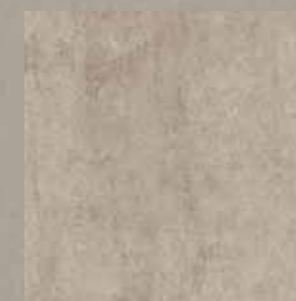
CONCTAPOR CONCRETE TABACCO GRES PORCELLANATO 74 MQ 45x45 18"x18" SPESSORE THICKNESS 9 mm MQ/BOX 1,418 KG/BOX 25,00 MQ/PALLET 73,74 BOX/PALLET 52 PCS/BOX 7

45x45 Pavimento Coordinato | Coordinated Floor | Sol Coordonné | Passende Bodenfliese