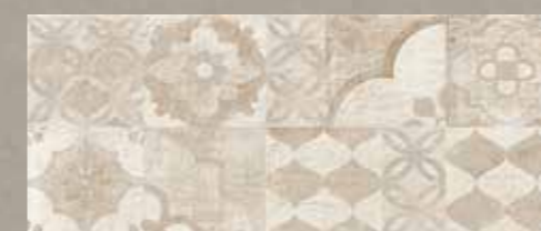
CONCDEAT CONCRETE DECORO WEST AVORIO/TABACCO 75 PZ 25x60 10"x24" PCS/BOX 4