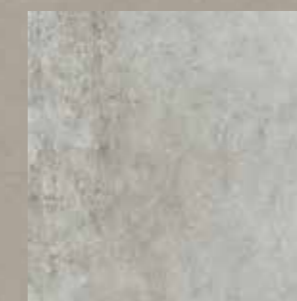
CONCPiPOR CONCRETE PIOMBO GRES PORCELLANATO 74 MQ 45x45 18"x18" SPESSORE THICKNESS 9 mm MQ/BOX 1,418 KG/BOX 25,00 MQ/PALLET 73,74 BOX/PALLET 52 PCS/BOX 7