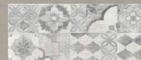
CONCDEGP CONCRETE DECORO WEST GRIGIO/PIOMBO 75 PZ 25x60 10"x24" PCS/BOX 4

45x45 Pavimento Coordinato | Coordinated Floor | Sol Coordonné | Passende Bodenfliese