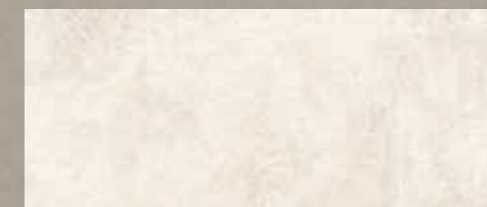
CONCAV CONCRETE AVORIO 85 MQ 25x60 10"x24" SPESSORE THICKNESS 9 mm MQ/BOX 1,35 KG/BOX 19,20 MQ/PALLET 64,80 BOX/PALLET 48 PCS/BOX 9

Conforme According to Conforme Gemäß UNI EN 14411 - L BIII