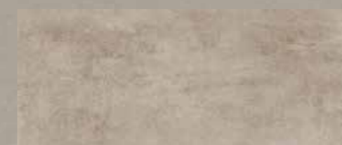
CONCTA CONCRETE TABACCO 85 MQ 25x60 10"x24" SPESSORE THICKNESS 9 mm MQ/BOX 1,35 KG/BOX 19,20 MQ/PALLET 64,80 BOX/PALLET 48 PCS/BOX 9